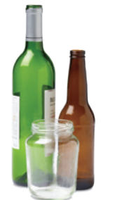
Glass Bottles & Jars (Even broken)