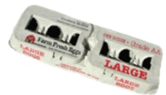
Food Scraps, Including Egg Shells, Meat & Bones, Pizza Boxes, Carboard Egg Cartons, Coffee Grounds & Any Food-Soiled Paper

Used Cooking Oil? Take to the West Sacramento Public Works Corporation Yard at 1951 South River Road (M-F, 8 a.m. to 3 p.m.)