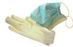
Disposable Gloves & Masks