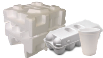
Polystyrene Foam & Packaging (Including Foam Egg Cartons)