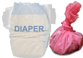
Diapers & Pet Waste