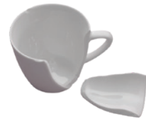
Broken Glass & Dishes (Please Wrap)