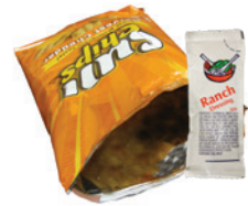
Snack & Chip Bags, Candy Wrappers & Condiment Packages