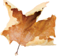
Grass, Weeds, Green Plants, Tree Limbs, Wood Chips, Dead Plants, Brush, Garden Trimmings, Leaves, Cut Flowers