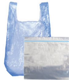
Plastic Wrap, Bags & Other Plastic Film