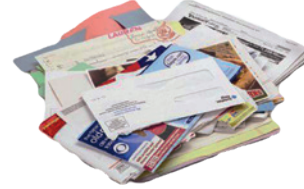
Clean Paper, Magazines, Newspaper, Junk Mail, Cardboard, Cereal Boxes

Please do not bag recyclables, keep loose. Please empty all containers prior to recycling.