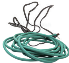
Hoses, Cords & Wire