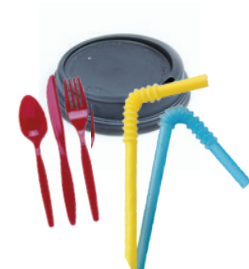
Cup Lids, Plastic Utensils, Plastic Straws (Including Compostable)