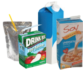
Beverage Pouches & Aseptic & Gable-Top Cartons