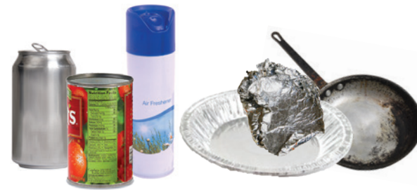
All Metal Beverage & Food Cans, Empty Aerosol Cans, Clean Aluminum Pans & Foil, Small Scrap Metal (Up To 20 Pounds)