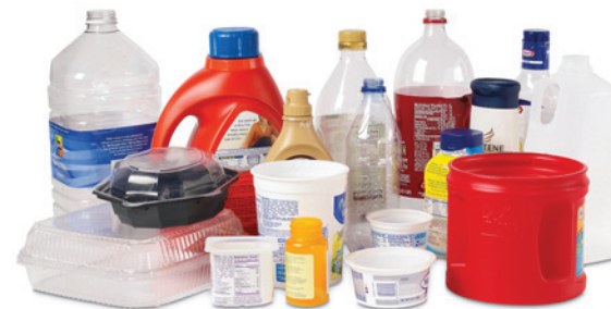
Empty Plastic Bottles, Rigid Plastic Containers, Plastic To-Go Containers (#6 not accepted)